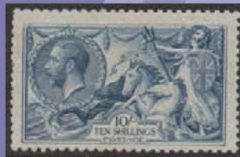
Lot 2372 Est £500