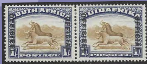
Lot 1934 Est £600