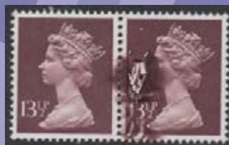
Lot 2445 Est £75