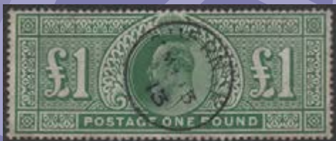
Lot 2337 Est £360