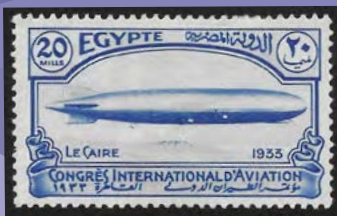
Lot ex 804 Est £24

Tel: 07938 601513 Email: info@avhstampauctions.co.uk