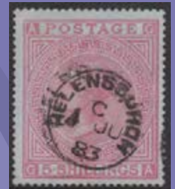
Lot 2292 Est £850