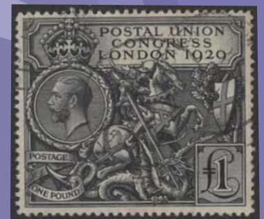
Lot 2383 Est £350