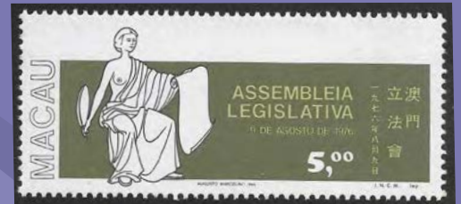
Lot ex 1446 Est £80