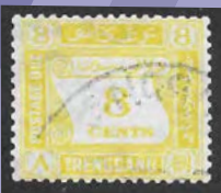
Lot 1496 Est £150