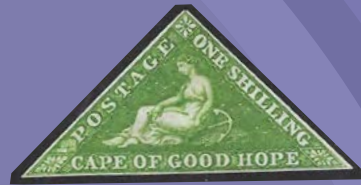
Lot 1951 Est £750