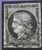
Lot 866 Est £90