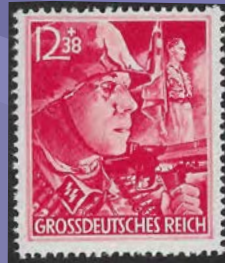
Lot ex 1039 Est £22